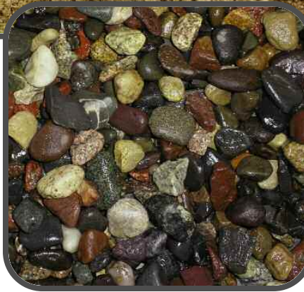
Exceptionally clean, round rock